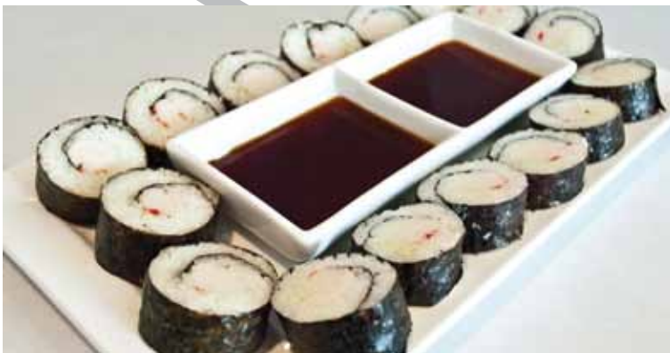
Californian Nori rolls