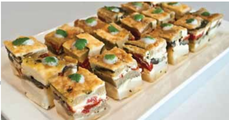
Frittatas with char grilled vegetables