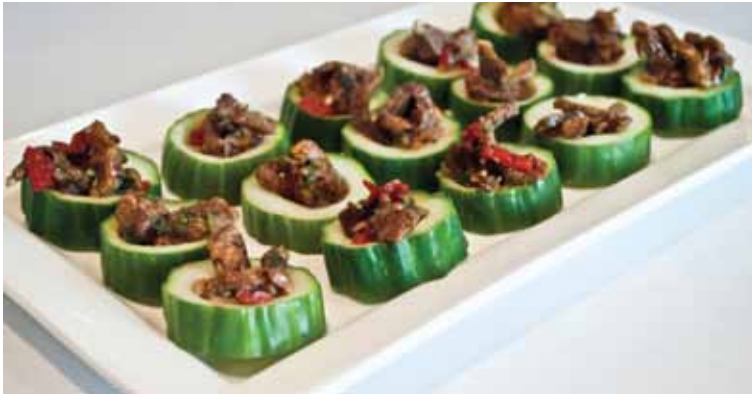
Beef salad in cucumber cups