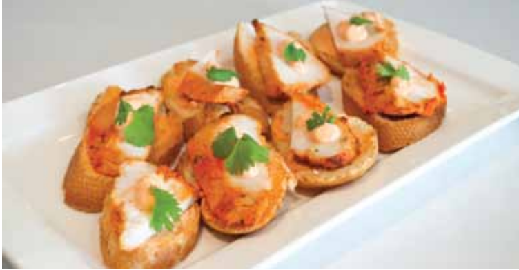
Spiced chicken on herb bread with red yogurt