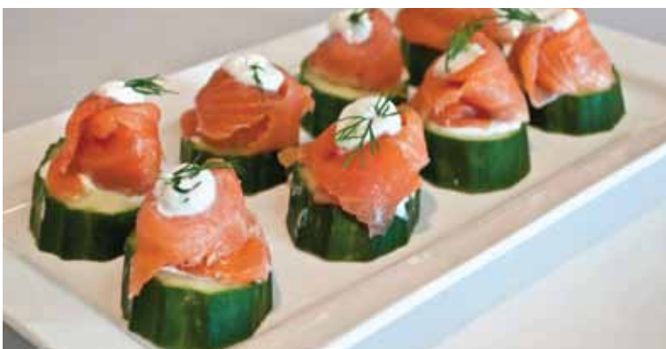
Smoked Tasmanian Salmon with cucumber and dill